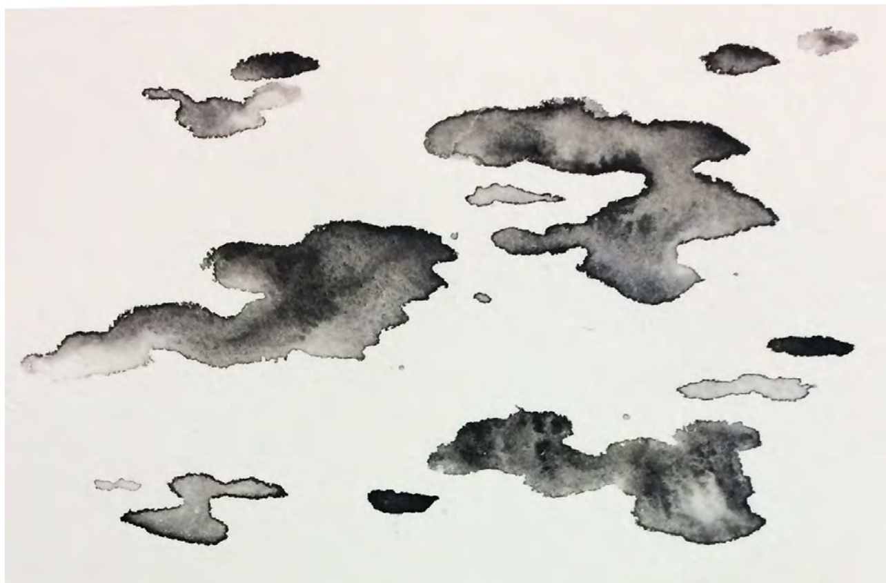
Abstract in Two Pieces By: Kate Amunrud